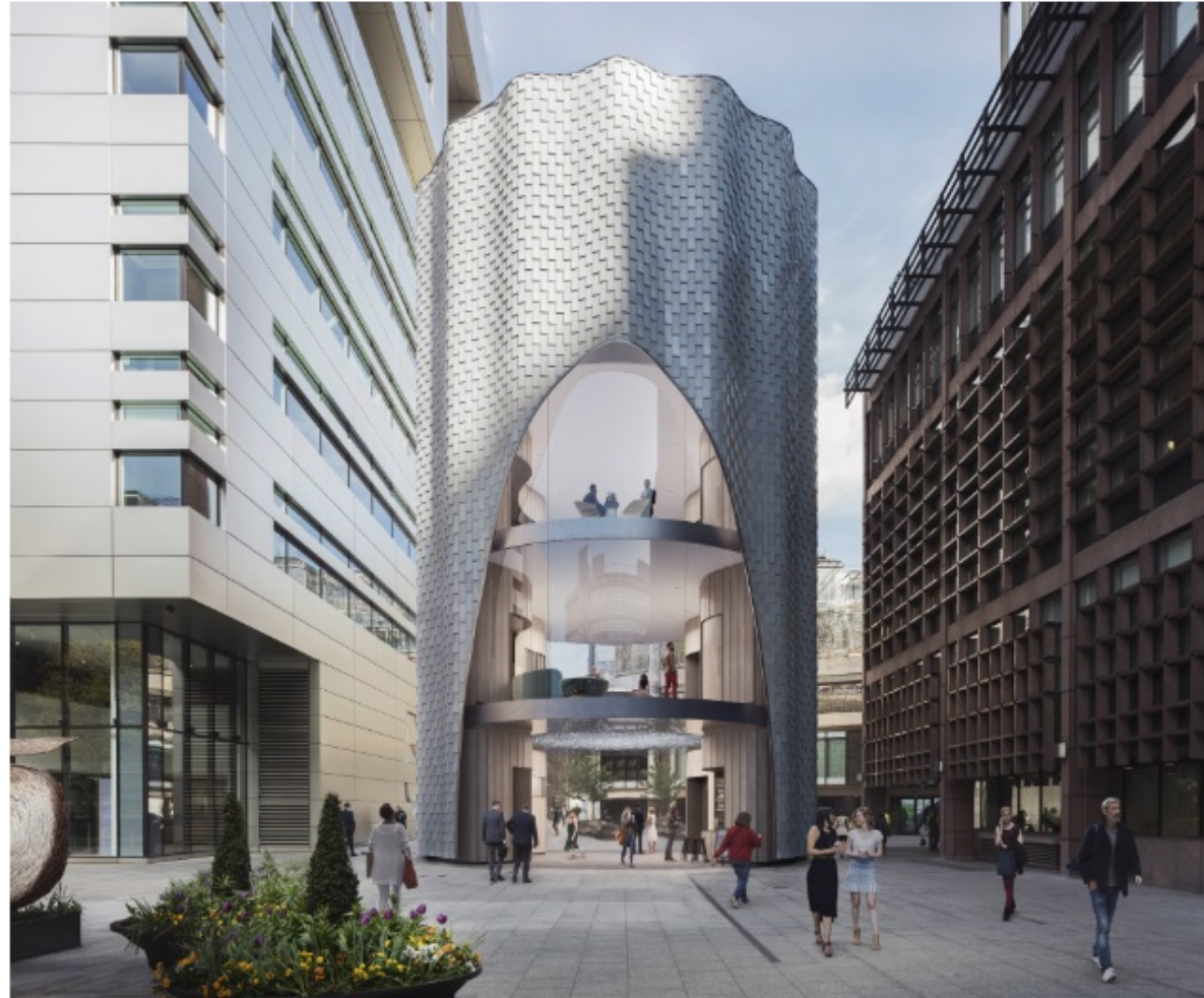
Approved plans for Three Broadgate

British Land and GIC have secured planning permission for the refurbishment of a building at the heart of the Broadgate Estate in the City of London.