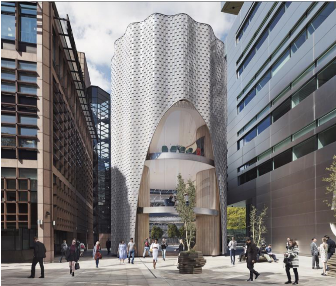
Work will start later this year

The proposal is to retain the cylindrical form of the three-storey building, re-clad the façade and insert a larger arched opening that aims to create better visual links and increase permeability through the space.